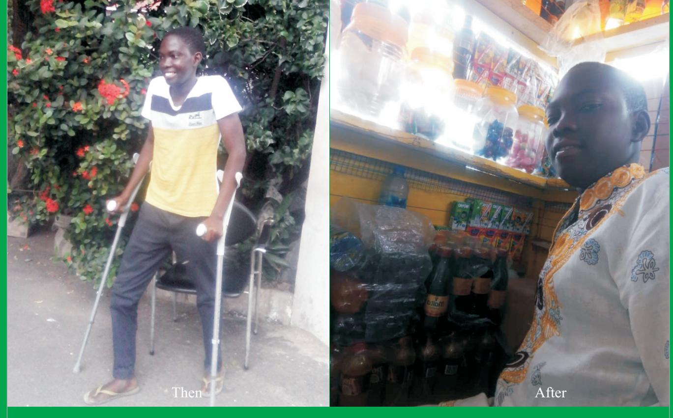
Beneficiary, Reesue selfcare programme