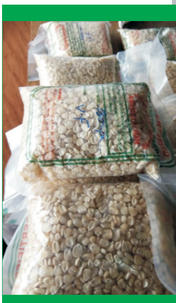
Seeds and Agro products donated to farmers by Rescue

Rescue Pilots its Agricultural projects before the start of the main program in the community. Under the pilot program, inputs are supplied on credit to farmers and program coordinators train and monitor beneficiaries to ensure best practices for better yields. People willing to farm are also trained to become commercial farmers. Existing farmers with challenging finances benefit as well. RESCUE pays upfront for inputs supplied under the “planting for food and jobs” which farmers pay after harvest with farm produce.