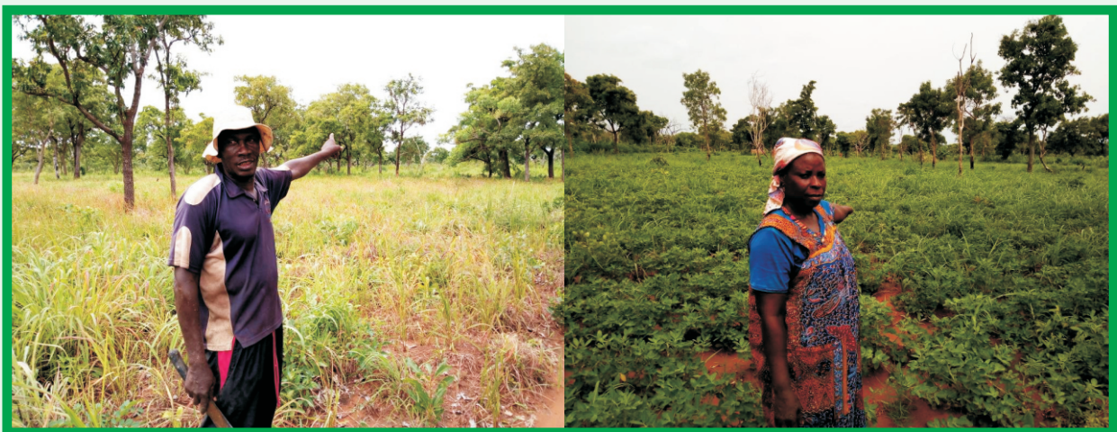
Allocated land for farmers