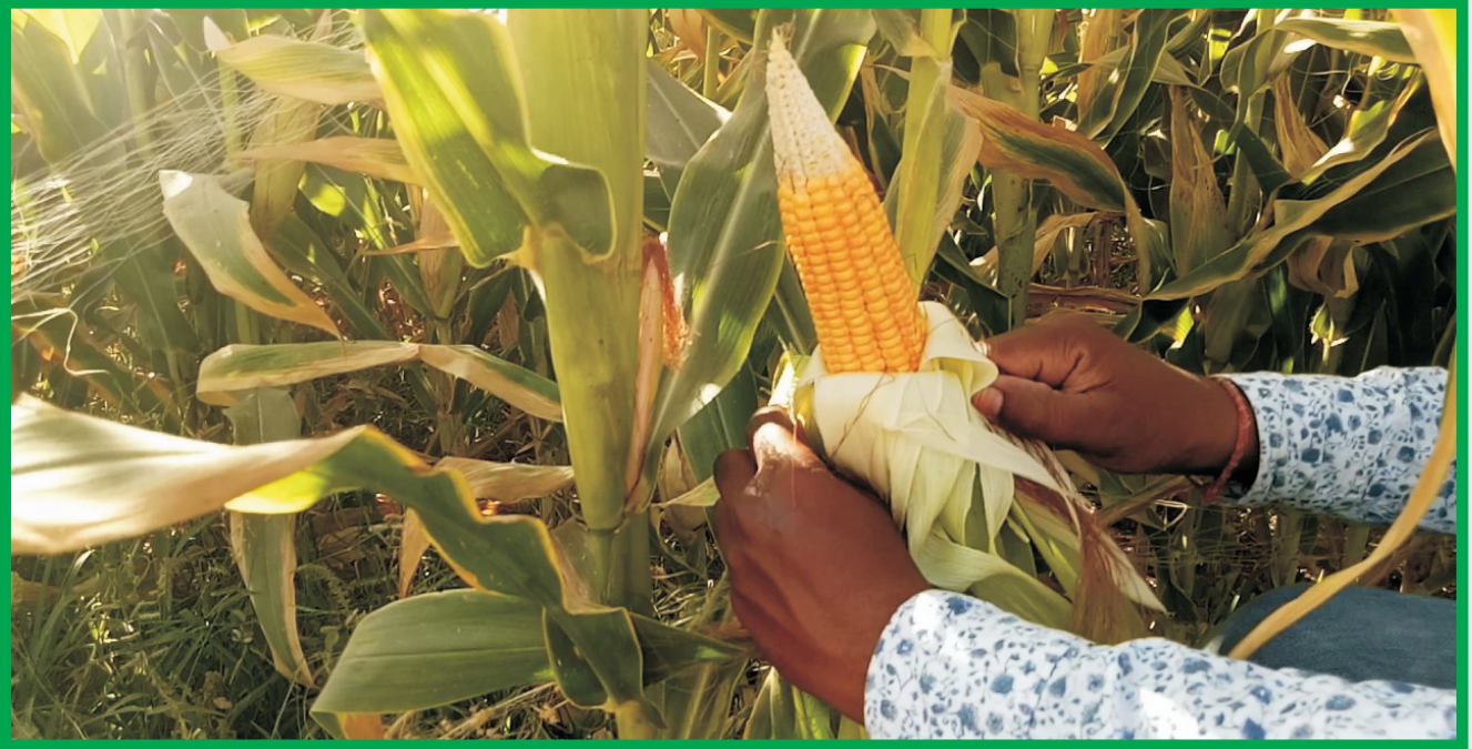
(Rescue Monitoring Team inspecting a new variety of maize )

In 2018 Rescue Volunteers piloted maize program in Larabanga in Savannah Region & Teyi in The Eastern Region. The program benefitted ten (10) farmers in each Region. Before then ground nut was modeled by the only female beneficiary under the program. Yields were good and RESCUE recovered the input cost and beneficiaries were rewarded