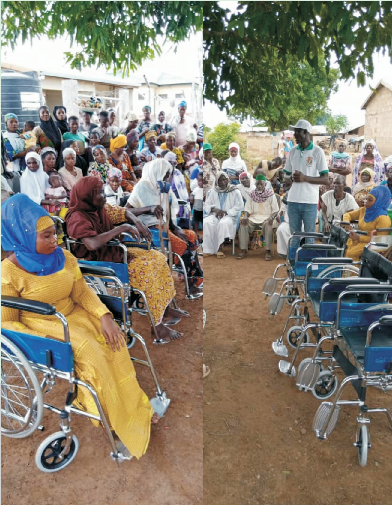
Wheel Chairs for hadicap ( funded by Rescue)