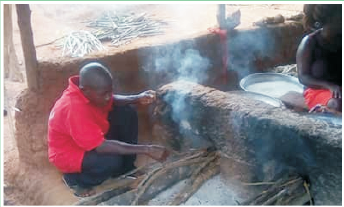
Processing of agric products (Casava into Gari)