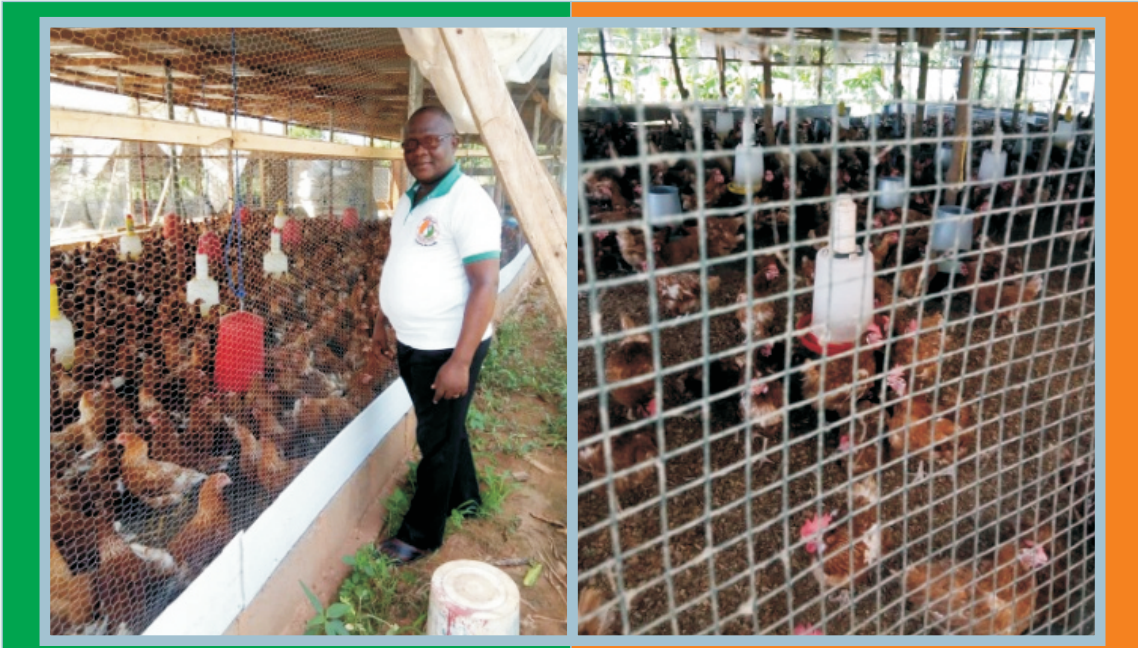
(Rescue funded Poultry project at Somanya)