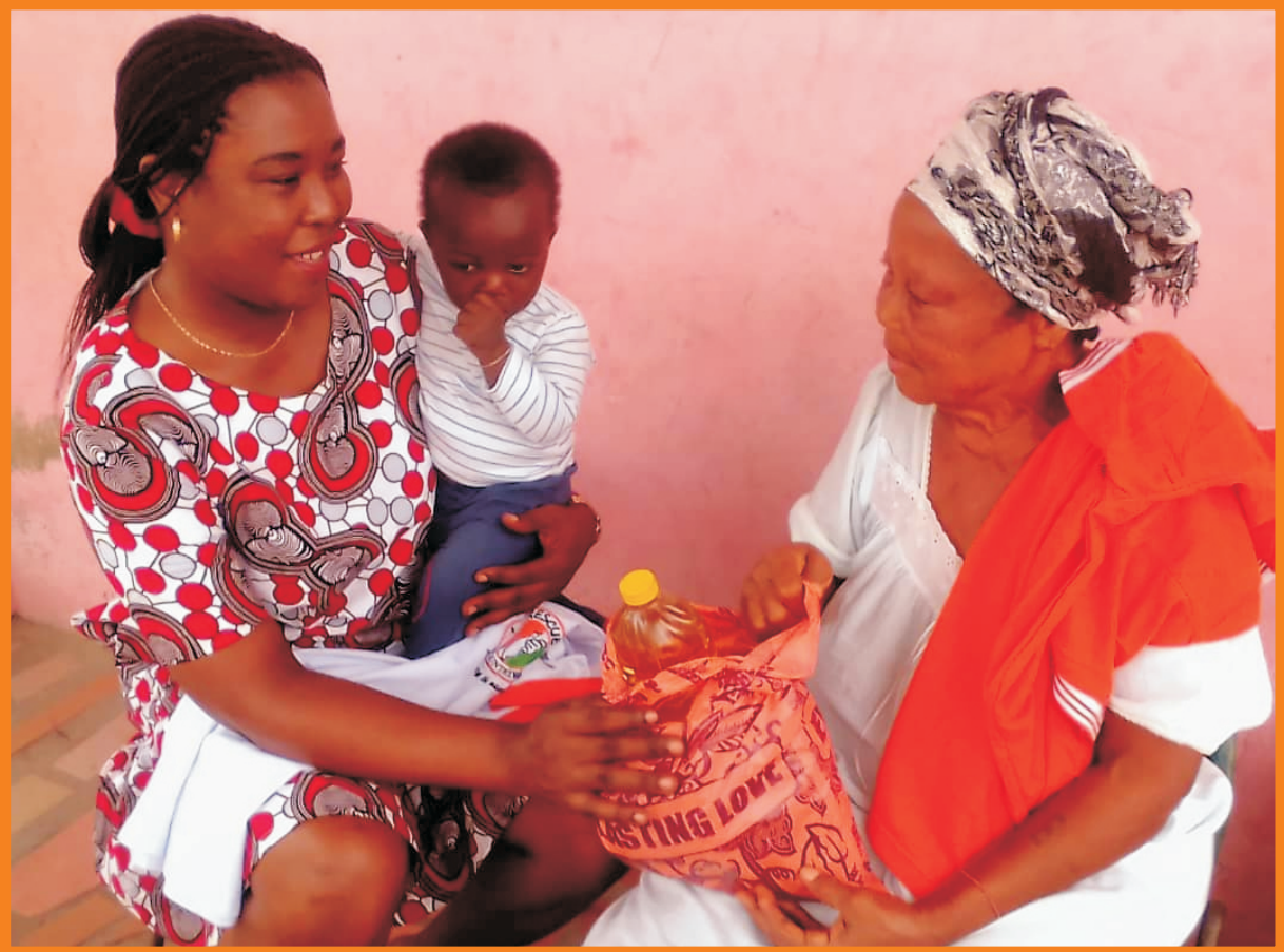
Visit and donateion