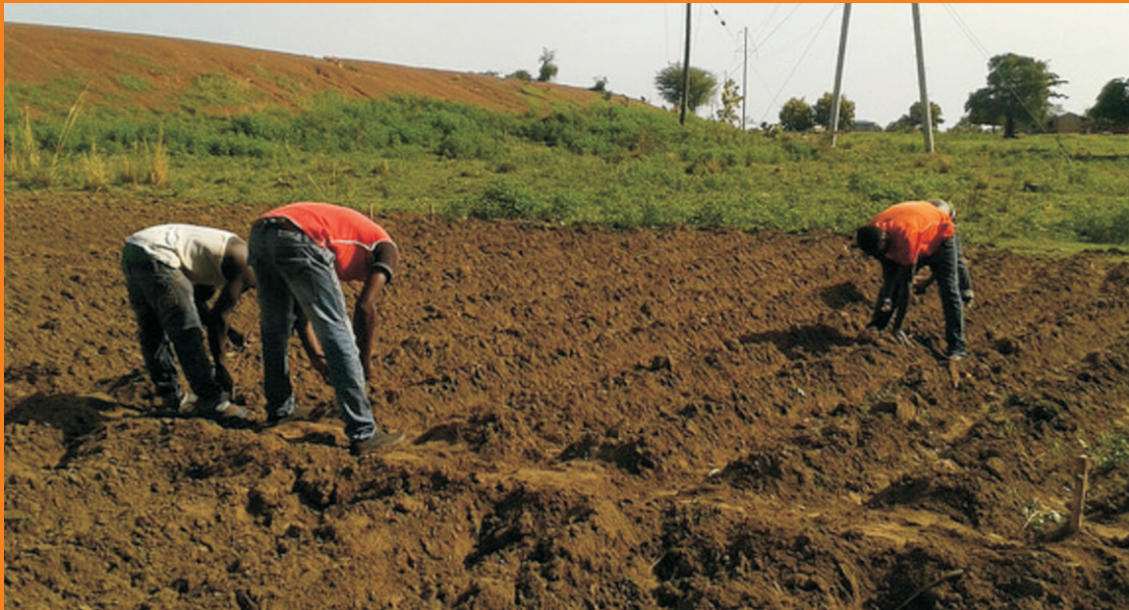
( Rescue Team Teaching Farmer on Precessing of Farm for planting at Teyi )