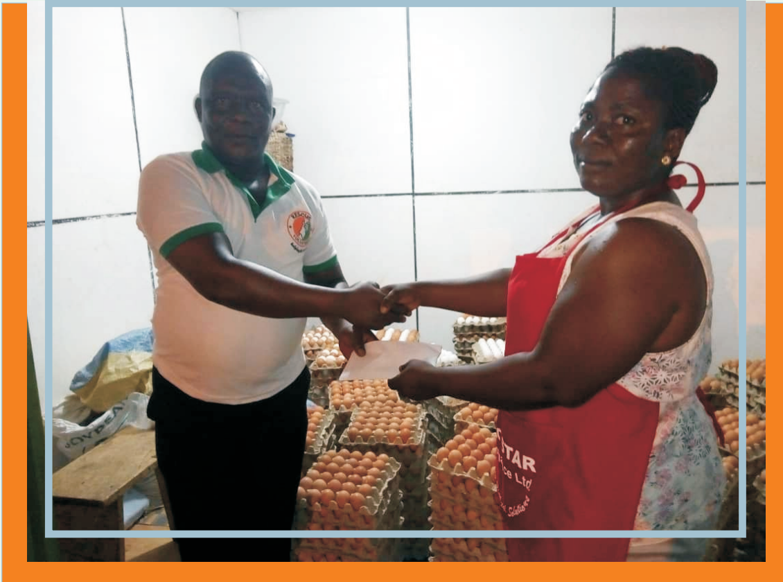
(Awarding customer loyalty )