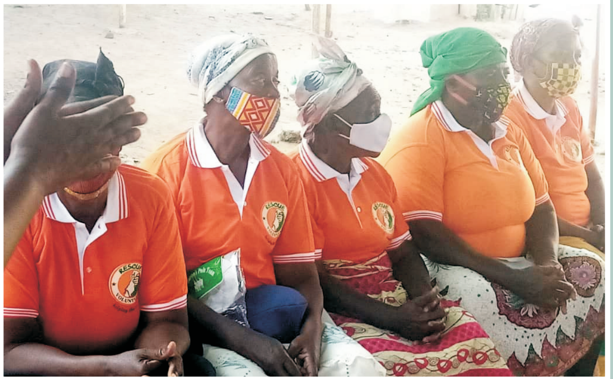
Health discussion with the elderly

There comes a time in one's life when he or she grows to become a senior citizen (elderly). Rescue Volunteers believes that this is a privilege that must be enjoyed and not lived in suffering. The organization therefore try to identify elderly with socio-economic challenges in our operational communities to be offered necessary assistance. Most of the elderly in difficulty compound their situation with the care of orphans and 'grandchildren' whose living parents have abandoned them.