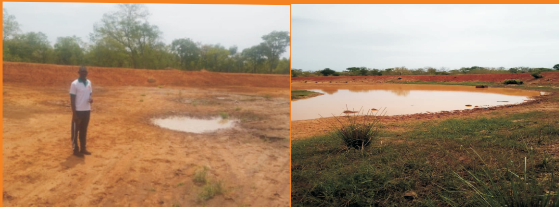
Dugout dam for lean season farming

Rescue is also taking steps to partner other investors and NGOs to add value to the farm produce to earn more income from the Agricultural Activities. Bee keeping and tree planting (Shea & Cashew) are also going to be major part of the work in the Northern Zone. This is to offer opportunity to a lot more beneficiaries under Rescue program in the North. In all our programs Rescue travels from the market to the farm, we arrange for inputs for farmers and apply best practices to ensure good results. Currently we have large market for our cassava making it necessary for us to increase our production. Investors are therefore being solicited for to partner us on this journey.