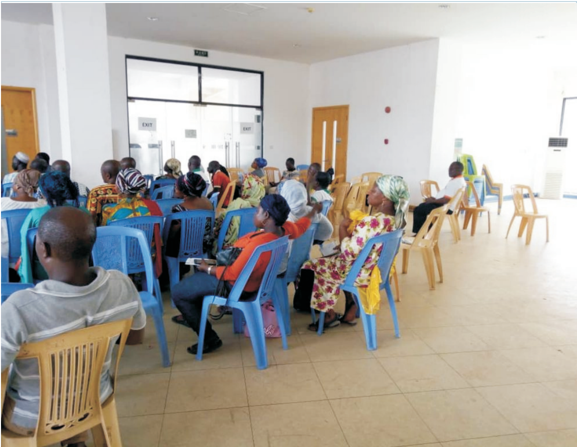
Manya Krobo NGOs