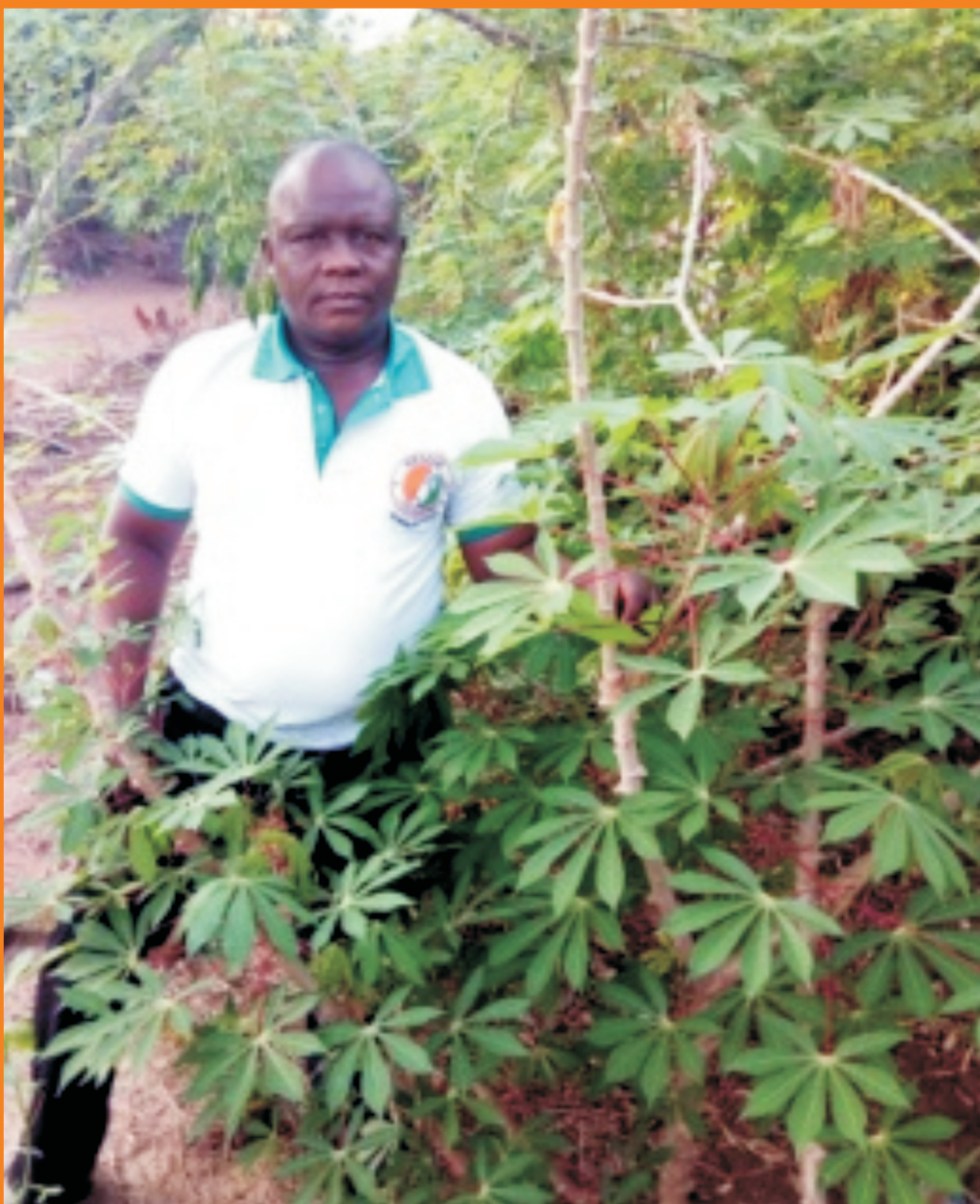
(Rescue Volunteers on Cassava Piloting Farm in Odumase)

In addition, a detailed audited financial report is presented to supporters and donors of various projects. This accounts for all monies received, where they came from and how they were expended. It also includes reason for over or under spending and assessment of how well the expenditures contributed to reaching the stated objectives of the project.