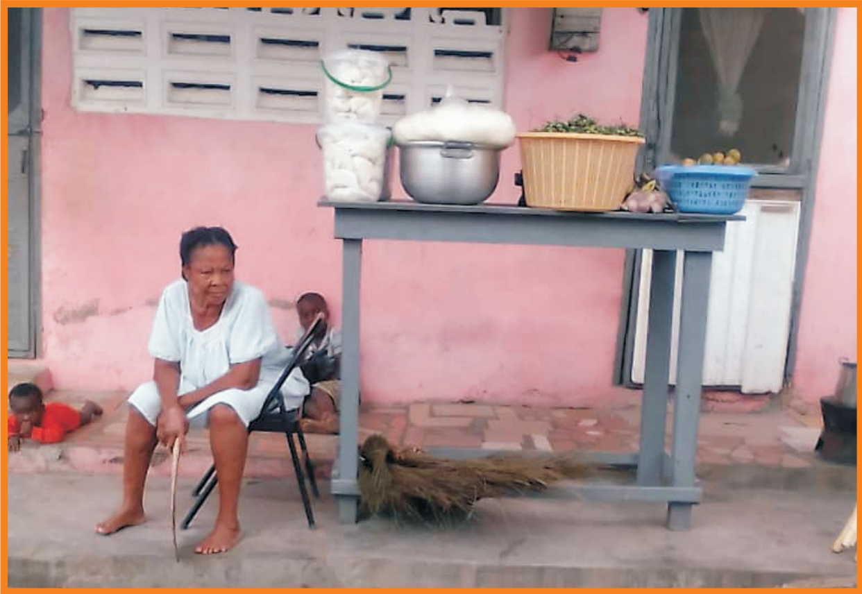
setting the elderly up in business