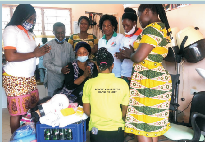
Affecting the needy positively - Introducing New apprentice into hair dressing