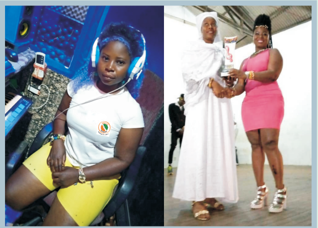
Affecting the needy positively - A Beneficiary Graduating