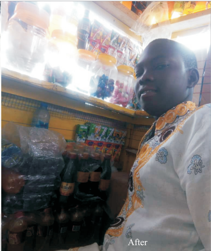
Beneficiary of Rescue selfcare programme