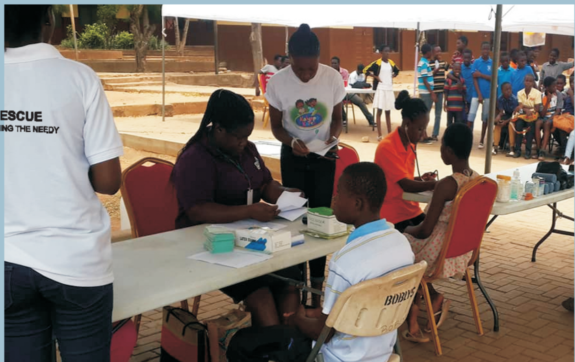
Rescue Sponsored Health Screening At

Health of Rescue beneficiaries is placed first in all our endeavours. In effect all community members are engaged in the initial presentation of health benefits to the community. The traditional council / authority is then engaged to discuss the health needs of the community members. This is followed by discussions with community health facility/post of resources needed to meet the health needs of community members. Due to this Rescue health interventions differ from one community to the other. All health projects in communities are done in collaboration with the traditional authority and existing health post or other benevolent group(s) or individual donors in or outside the community.