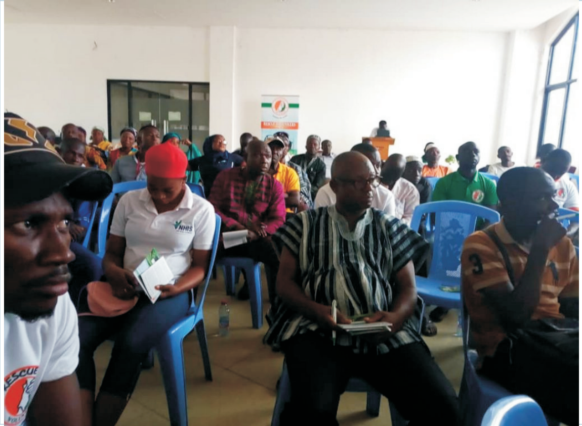
Northern Development Initiative