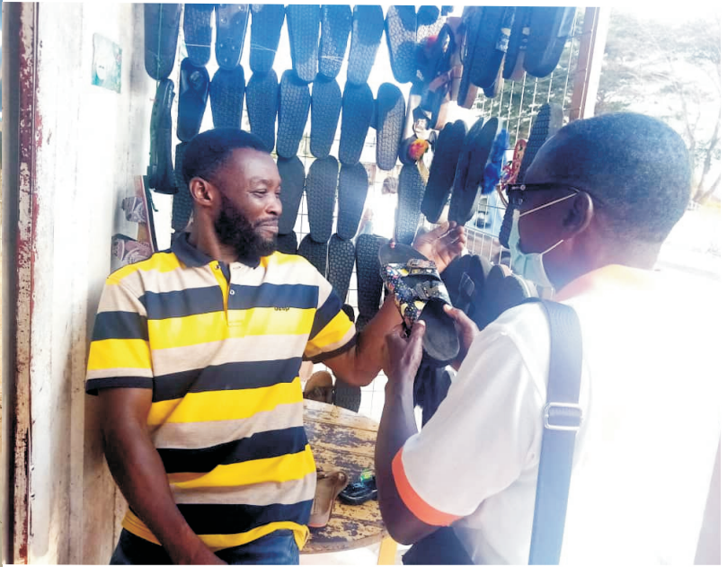
Monitoring welfare of the handicap beneficiaries of Rescue Volunteer's Self Care programmes