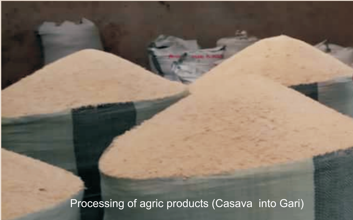
Processing of agric products (Casava into Gari)