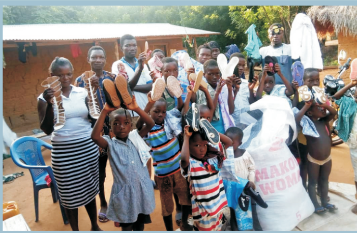
Affecting the needy positively - (Donations)

Arts and Culture has been an integral part of Rescue work and therefore Rescue Volunteers has joined hands with the National Art and Cultural centre in Accra to train head porters (Kayayei) in artistic designs for economic gains. The organisation also fosters a good relationship with the people of Larabanga, a Community in the Damango District in the Savannah Region to promote the culture of Ghana through series of activities at the Rescue training centre. Some of our young women have been mentored to promote the Ghanaian culture through their music as artists.