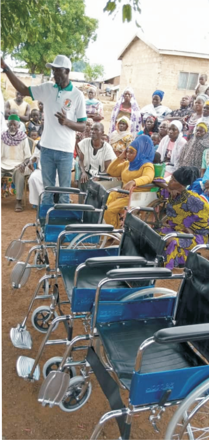
Donation of Wheel Chairs to the Health Post and Individuals at Larabanga, Savannah Region