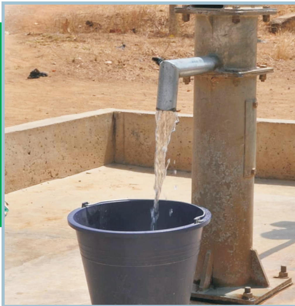
Portable water for Community ( funded by Rescue)

Rescue collaborates with other NGOs to organise community health screening and sanitation exercises in the operating communities. Community health posts also benefit from voluntary services and donations to support their work.