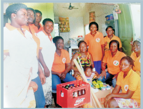
Affecting the needy positively - Introducing New apprentices into dress making