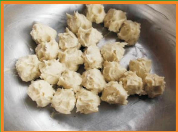
Shea Butter Production At Larabanga