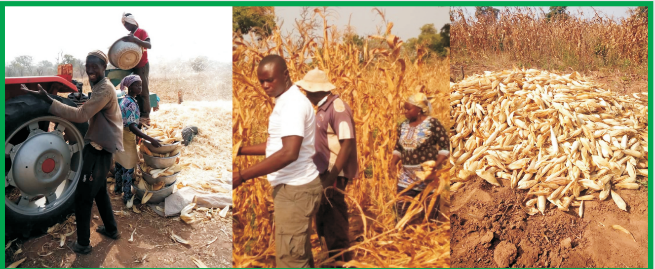
(Harvesting at the end of the planting season )

At Teyi, both Organic & fertiliser based farming was tested concurrently to ascertain the viability of organic farming in that region This was to demonstrate and introduce other modern alternative methods to farming. Yields were as expected.