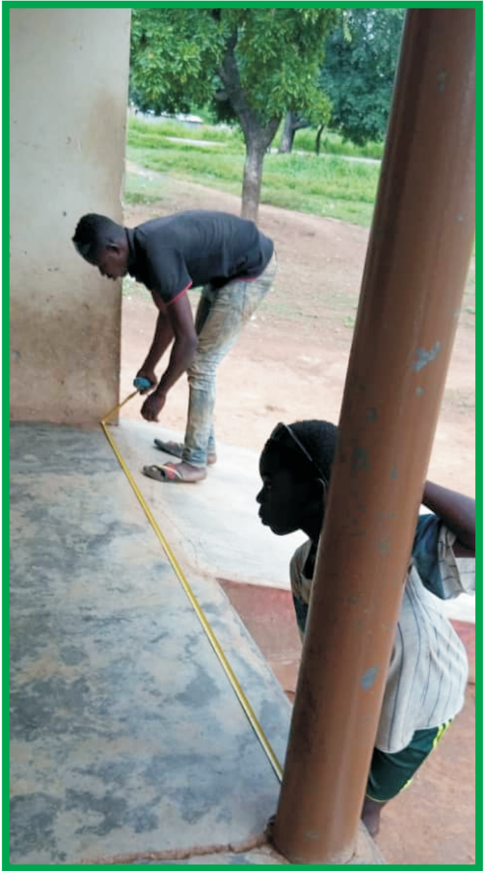
Fencing the entrance of Larabanga Health Post